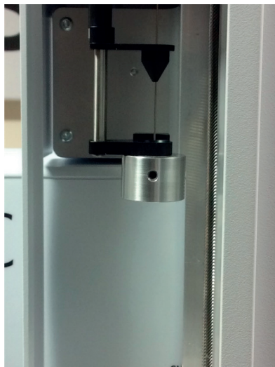
Adapter for syringe tool.