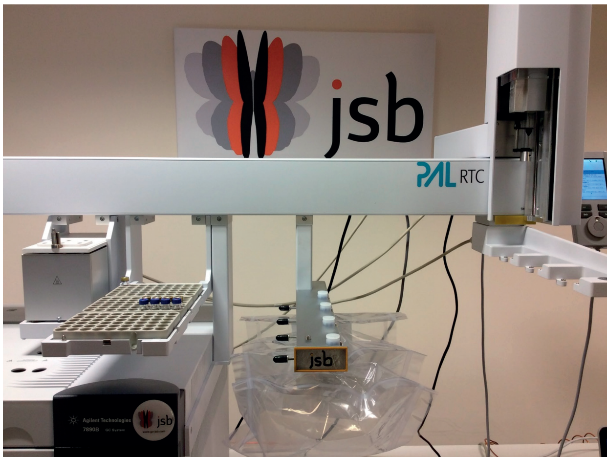
One 4 bag module mounted on a PAL.

JSB United Kingdom and Ireland Unit 25 Graylands Estate Langhurst Wood Road Horsham West Sussex RH12 4QD t: +44 (0) 1628 854565 e: info@go-jsb.co.uk